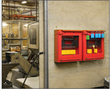
Areas with Frequent Lockout

When placed near production equipment, or in parts of the facility that regularly undergo maintenance, the S3500 Series can help reduce the amount of time it takes to complete group lockout from start to finish. The full permit station (S3500) provides a place to keep equipment locks, secure the key(s) and display reference documentation in the location where the work is being done, minimizing movement of equipment and personnel throughout the facility.