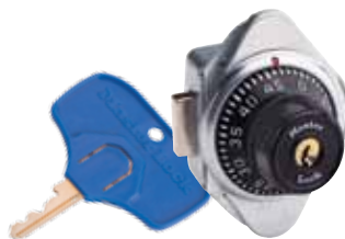
1676MKADA For Single-Point Horizontal Latch Lockers (Deadbolt) Patent Pending