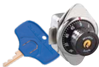
1656MKADA For Single-Point Horizontal Latch Lockers (Springbolt) Patent Pending