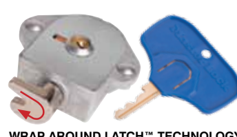
WRAP AROUND LATCH™ TECHNOLOGY Patent Pending 1790MKADA For Single-Point Wrap Around Latch Lockers Patent Pending