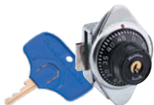
1636MKADA For Multi-Point Latch Lockers Patent Pending