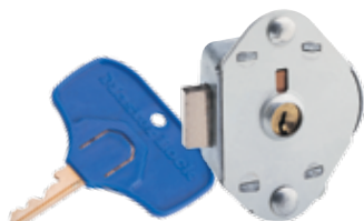
1710MKADA For Single or Multi-Point Latch Lockers Patent Pending