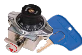
WRAP AROUND LATCH™ TECHNOLOGY Patent Pending 1695MKADA For Single-Point Wrap Around Latch Lockers Patent Pending