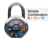
1525EZRC Simple Combos™

Master Lock ADA Inspired locks address special needs beyond those outlined in the "2010 ADA Standards for Accessible Design". These portable locks are designed to be easy to use and assist those with physical or cognitive challenges operate a lock independently. All ADA Inspired locks fit most standard lockers.