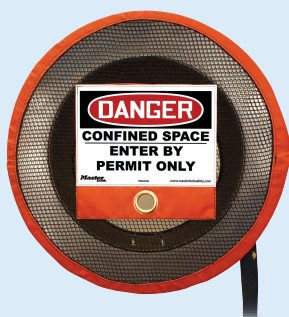
S202CS Lockable, ventilated