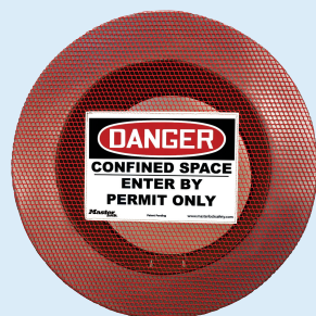
S201CS Elastic, non-lockable, ventilated