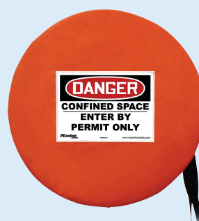
S203CS Lockable, solid