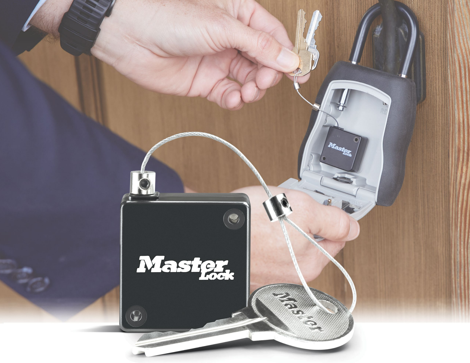
5490D Retractable Key Tether