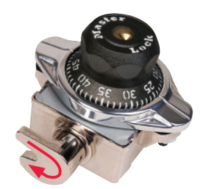
Latch Wraps Around The Latch Plate

The patented model 1690, 1695MKADA, and 1790 built-in locks use the same technology as an automotive door lock system, utilizing slam shut operation combined with a rotating latch that wraps around the latch plate. Designed for Single Point Latch Lockers, these locks provide the most robust design and requires the least adjustment for proper operation (U.S. Patent No. 7,984,630).