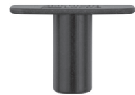
Actuator Positioning Plug Tool (APKGP33174)