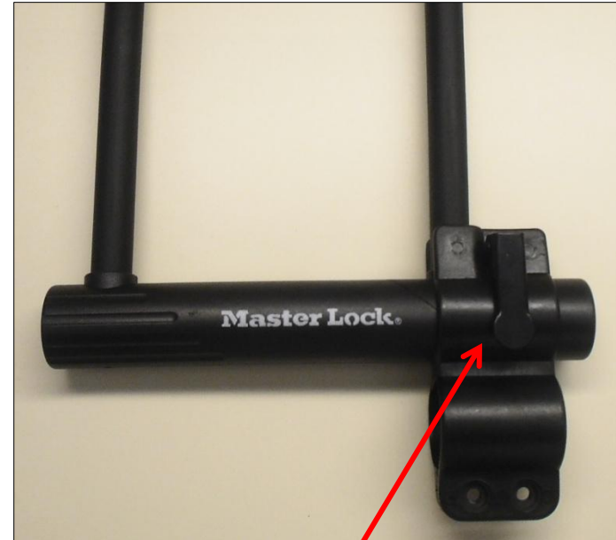
tightened wing nut for added security