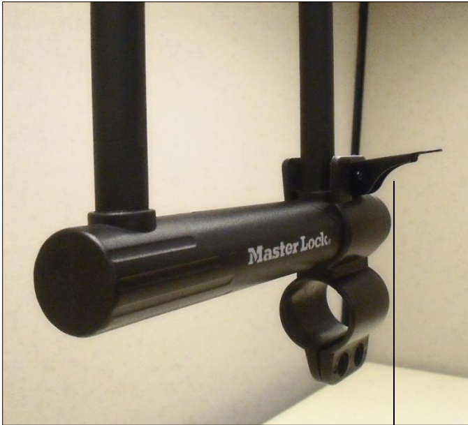
location for optional screw or wing nut

Optional Step 7: An additional screw or wing nut (pictured on slide 2) may be used to provide added security on the upper portion of the carrier bracket