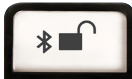
ADA Bluetooth® Mode*