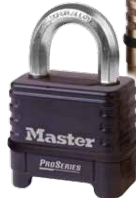
Die Cast 1178