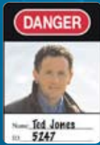
Photo ID label for S31, S33, 406 and 410. Label model S142 available August 2010.

Available Key Retaining (model S31) or Non-Key Retaining (model S33) for use with group lockout.