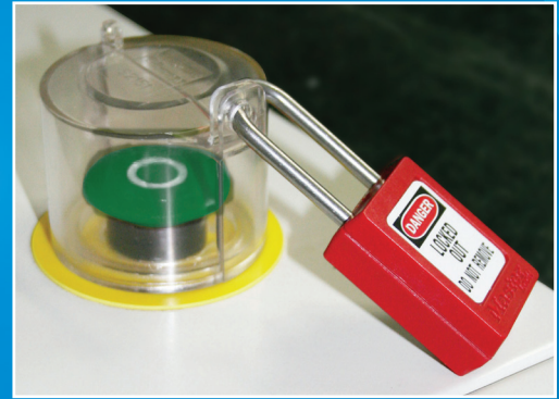
S2151 installed with S31RED.