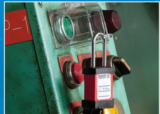
S2153 installed with S31REDCOV.