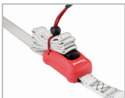
Practical Strap Trap™