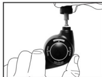
4. Pull out the cable to open the lock.