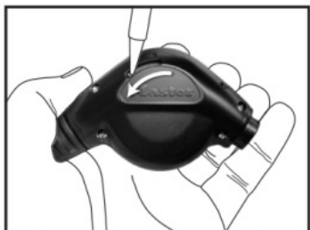
6. Slide the reset lever back to the “down” position.