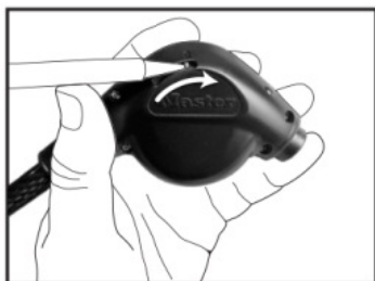
2. On the back of the lock, use a pointed object to slide the reset lever into the “R” position.