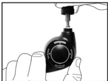
1. Open Lock.

You can set your combination to any pattern of any length. FOLLOW INSTRUCTIONS EXACTLY!