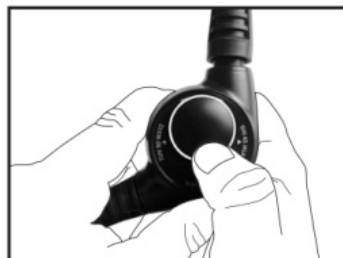
8. The lock will now open with your new combination. Remember to push the cable firmly toward the lock TWICE each time before opening.

9. Store your combination at masterlockvault.com