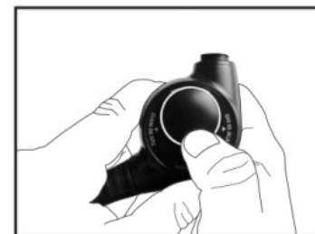
5. Enter your new combination.