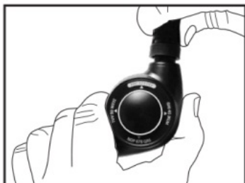
7. Insert the cable into the lock and push firmly.