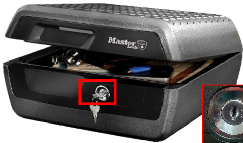
KB-25ML, KB-50ML, CB-10ML, CB-12ML, P008EML, L1200, LCHW20101, LCFW30100, LFHW40102, X041ML, X055ML, X075ML, X125ML, PP1KML, MLD08E, MLD08EB models