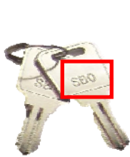
CB-10ML, CB-12ML, KB-25ML, KB-50ML models