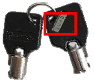
LTW123GTC, LTW205GYC models