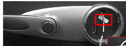
T0, T6, T8 models

Key number can be found behind the keypad