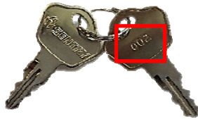
L1200, LCHW20101, LCFW30100, LFHW40102 models