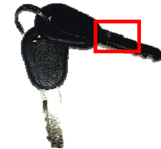
X041ML, X055ML, X075ML, X125ML, MLD08E, MLD08EB, PP1KML models