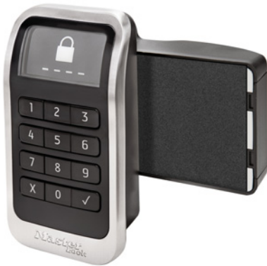
3685 Electronic Built-In Locker Lock

The Master Lock Electronic Built-In Locker Lock offers a new level of innovation with its high-visibility display screen for intuitive operation, long battery life to reduce operating costs, and anti-jamming features for reliable security.