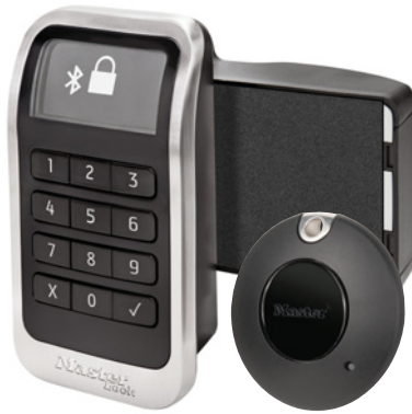
3681 Electronic Built-In Locker Lock with Bluetooth-Enabled Fob for ADA Applications