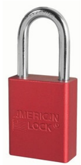
A1166KAMKRED Red Anodized Aluminum Safety Padlock, 1-1/2in (38mm) Wide with 1-1/2in (38mm) Tall Shackle, 6-pin Cylinder, Keyed Alike Master Keyed