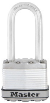
M1EURDLH 45mmExcell® 51mm