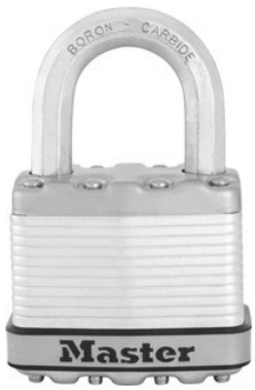
M5EURD 52mm Excell®