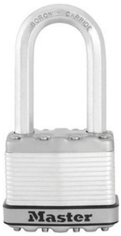
M5EURDLH 52mmExcell® 51mm