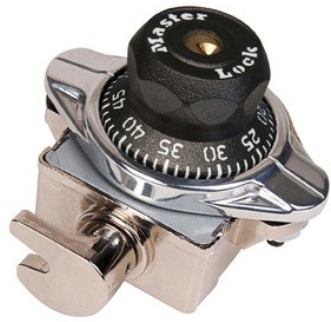
1690 wrap-around-latch™ -