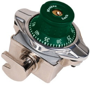
1690MDGRN wrap-around-latch™ -