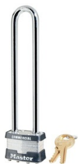
21LN 44mm 15cm